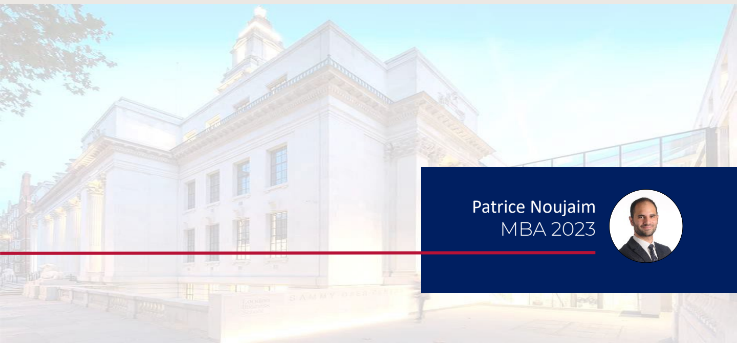
Patrice Noujaim MBA 2023

With regard to the transport system in London (run by Transport for London, whose board members are appointed by the Mayor of London), new infrastructure, such as the planned extensions to the Bakerloo and DLR lines, are expected to unlock tens of thousands of new homes in London over the next 5-7 years. More infrastructure projects such as these will help the city close the gap between supply and demand of housing , the panel concluded.