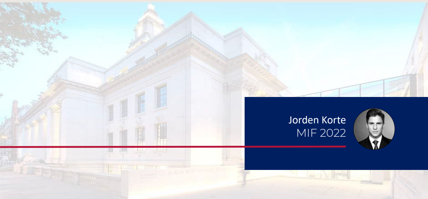
Jorden Korte MIF 2022

The discussion concluded with the conviction, that cities done well were the most sustainable way of living.